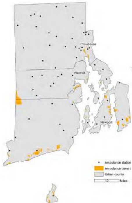
Ambulance Locations and Deserts