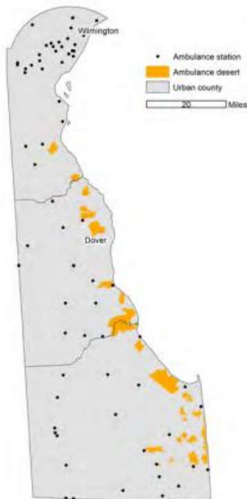
Ambulance Locations and Deserts